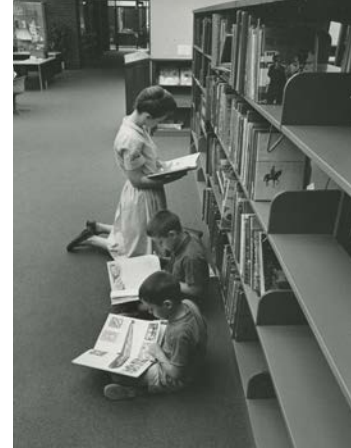
Patrons at the first Main Library, built in 1964