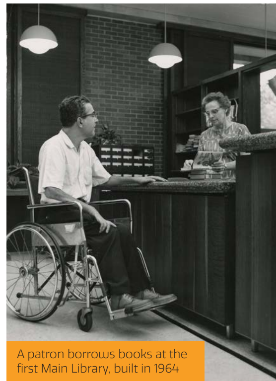
A patron borrows books at the first Main Library, built in 1964