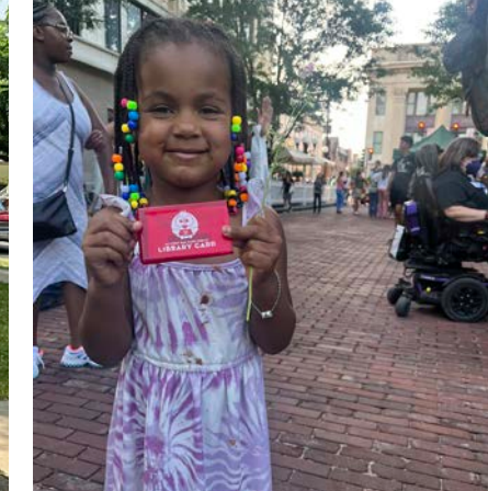
Young cardholder at Oak Park’s Thursday Night Out, July 2023