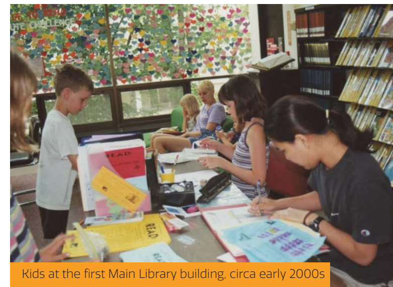
Kids at the first Main Library building, circa early 2000s

Today, the library continues to respond to our community by being flexible with spaces and more. For example, in the past couple of years we’ve dedicated areas on the second floor for middle schoolers and high schoolers, plus staff who specialize in the interests and needs of kids in these age groups. In April, we opened the third-floor Creative Studio, a digital makerspace where you can digitize old VHS tapes, make 3D-printed designs, and record audiobooks, podcasts, and more. And this fall, we’ll launch an exciting new Library of Things collection, lending items like recreation equipment, crafting tools, and more.