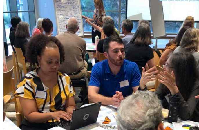
Community members discuss Climate Ready Oak Park, Main Library, August 2023