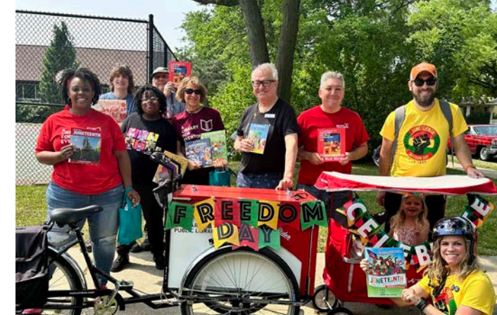
Library board and staff with the Book Bike at Oak Park’s Juneteenth Parade, June 2023